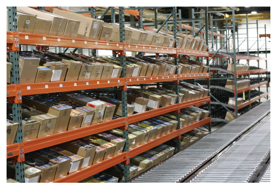
EDC has installed new software, two new pick lines and over half a mile of conveyor to support the order fulfillment process.